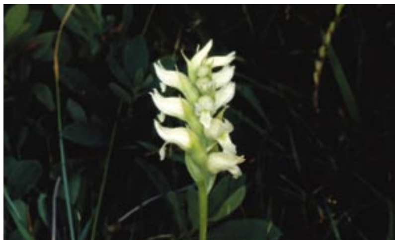
Right: The flower head of an Irish Lady's-tresses orchid growing on a loch shore on Benbecula. Deas: Dìthean Mogaairlean Bachlach Bàn a' fàis aig oir loch ann am Beinn na Faoghla

any site which is newly provided with a summer grazing break (Section 2.6) is likely to provide a nectar and pollen source for machair bumblebees.