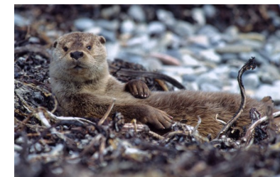
Otter relaxing

Otter Walk — Join us for an evening walk, learning about the wildlife of the moorland and loch and hopefully gain a glimpse of otters as they search the shoreline and play in the surf. Meet at Loch Sgioport, east end car park, Isle of South Uist (NF 827386) at 7.30pm . Duration 2.5hrs. Charge: RSPB Members £2, Non-members £5, Children FREE.