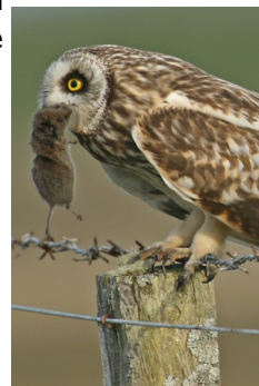
Short eared owl

Meet at Committee Road Car Park, Isle of North Uist (NF 792704) at 7.30pm . Duration 2.5hrs. Charge: RSPB Members £2, Non-members £5, Children FREE. Contact Jamie Boyle on 07768 042547.