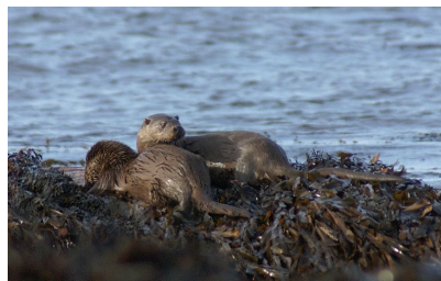
Otters at Stoneybridge

Otter Walk — Join us for a morning's walk, learning about the wildlife of the moorland and loch and hopefully gain a glimpse of otters as they search the shoreline and play in the surf. Meet at Langass Lodge Hotel, Lochport, Isle of North Uist (NF 839651) at 10am . Duration 3 hrs. Charge: RSPB Members £2, Non-members £5, Children FREE.