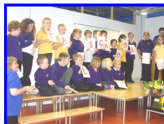
Laxdale After School Club