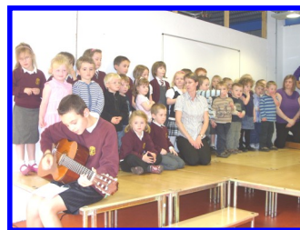
Stornoway Primary, Nursery & P1 Gaelic

Primary Gaelic Nursery and Primary 1 GM, and Laxdale After School Club.