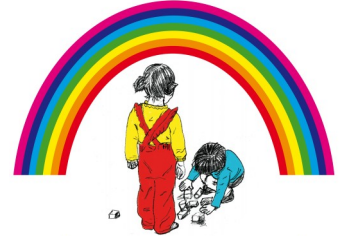
Early Years Partnership