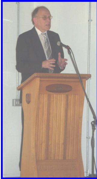
Adam Ingram Minister for Children and Early Years

In May 1998 the Government published "Meeting the Childcare Challenge" – A Childcare Strategy for Scotland. The overall aim of the strategy was to make high quality affordable childcare available in every area and information on available childcare. In addition the Government promised every eligible 3 and 4 year old child a part time funded pre-school education place. The Sure Start initiative was also launched around this time and aimed to help disadvantaged families with very young children.