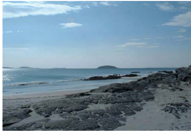
Coilleag a Phrionnsa, Eriskay