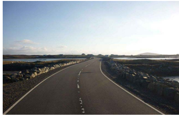
North Ford Causeway, Uist