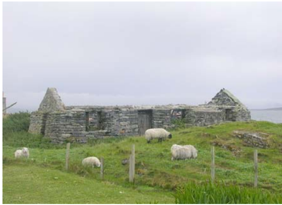
Ruisgarry, Berneray, North Uist