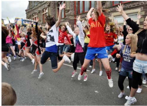
Dance group at the Lewis Carnival