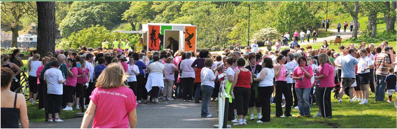
Womens Cancer Challenge 5k, Lews Castle Grounds, Stornoway