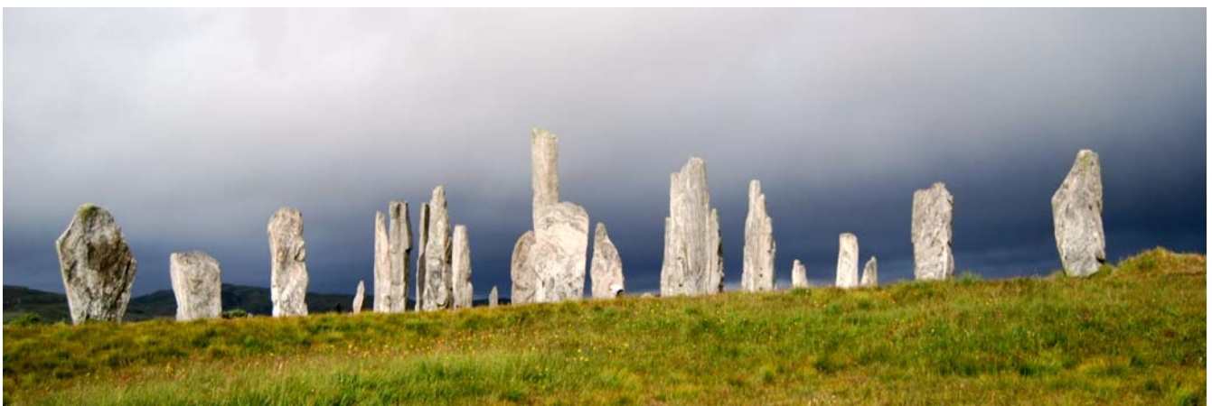
Callanish Stones, Isle of Lewis