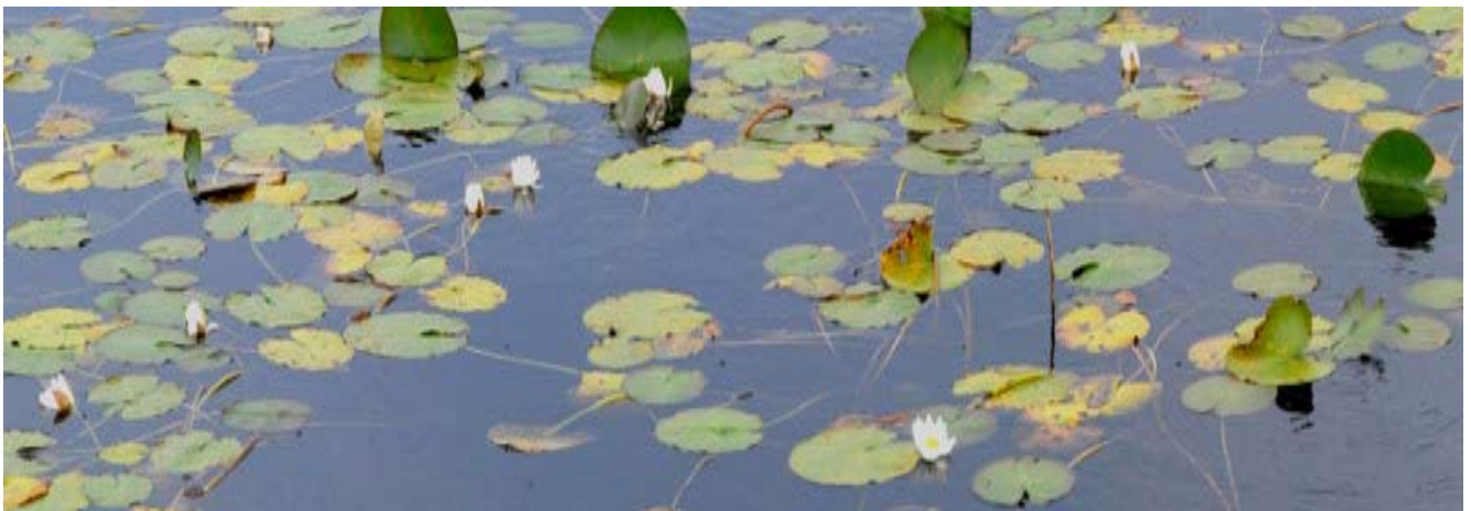
Water Lilies at Dalmore, Isle of Lewis