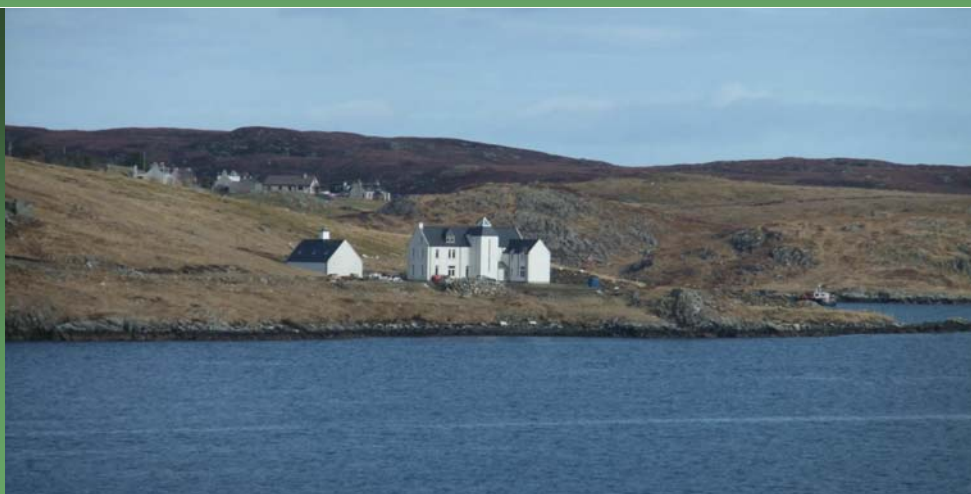
Keose, Lochs, Isle of Lewis