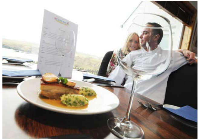
Dining in the Outer Hebrides