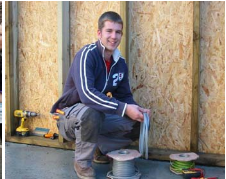
Local Electrical Business