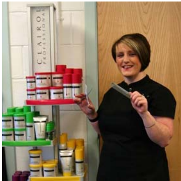
Local Hairdressing business