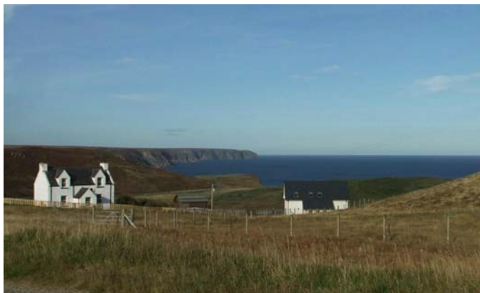
North Tolsta, Lewis

Note: All figures are estimates and should be used with caution