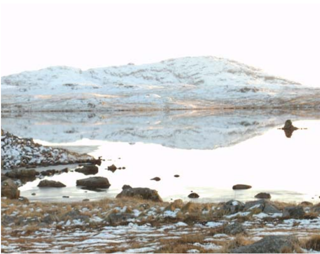
Loch an Dùna, Bragar, Isle of Lewis