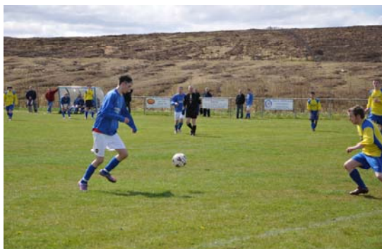
Playing Football West Side v Westford