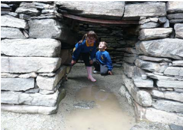
Children at the Broch, Carloway