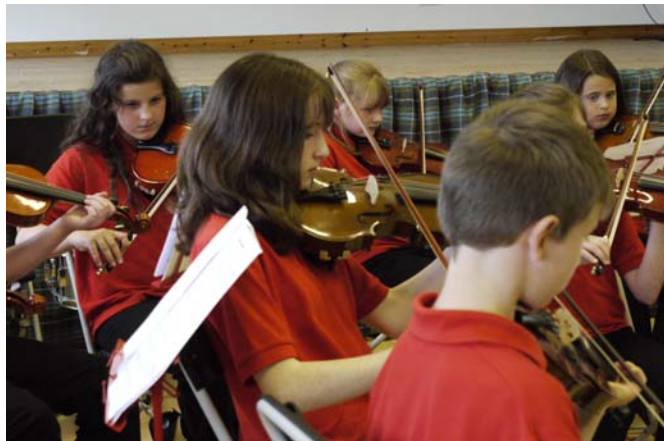
Playing traditional music