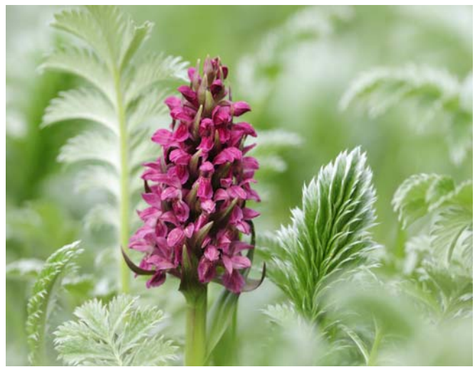
Orchid & Silverweed on Benbecula Machair