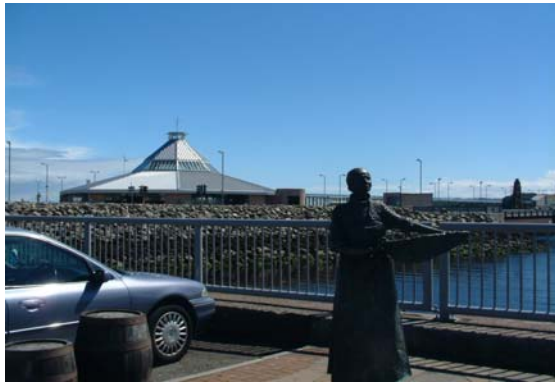
Ferry Terminal, Stornoway