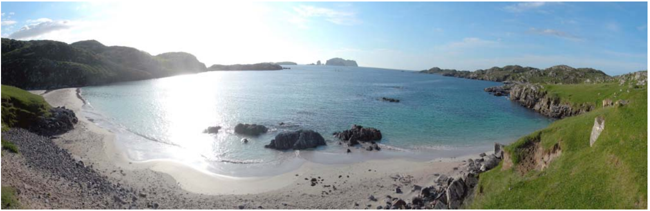
Bosta, Bernera, Isle of Lewis