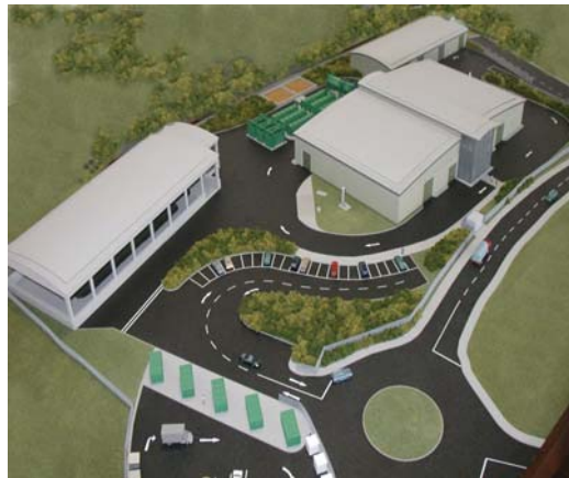
An artists impression of the new facility

The project is being developed in conjunction with Earth-Tech, an experienced developer of waste management and re-processing facilities and is planned for completion during 2006.