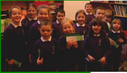
Learning the 3R's at Scalpay School. (above) and Paible School (below). That's Reduce Reuse Recycle!