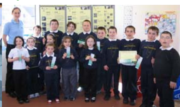
Above - Tolsta Playgroup Right (top to bottom)- Airidhantium, Bernera, Daliburgh, Sandwickhill Playgroup and Stornoway Play- group.