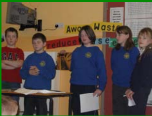
Above—Pupils at Tong Schools give their own talk on Recycling. Right—They know the 3R's at Stonybridge too!

Did you know? The Western Isles generates nearly 1 tonne of Waste per person per year!