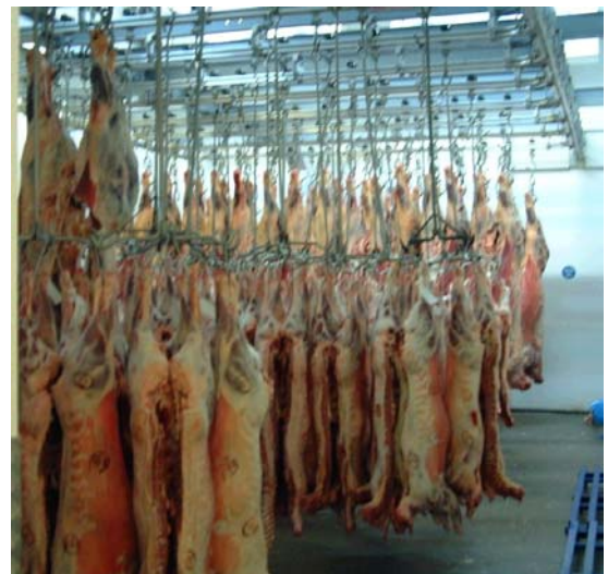
Main Chill Store (Approx. 6.5m x 12m)