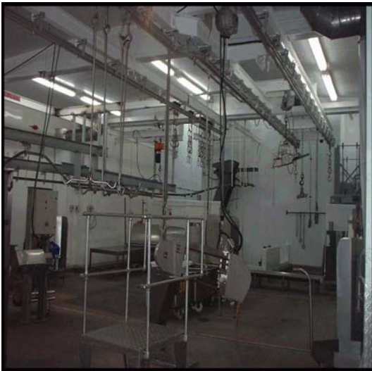
“Killing Hall” (Approx. 17.5m x 9m)

Kentmaster 500 Brisket saw Kentmaster 203 Beef carcass splitting band saw Freund Lowline bandsaw AEW 350 Bandsaw Rothman pig tank Dual Aluminium track throughout building c/w hangers Lambline c/w secondary support steel Bitterling S10053 sheep pelt puller Demag 1000 kg transfer hoist Demag 250 kg transfer hoist Hitachi 250 kg transfer hoist 1 tonne transfer hoist Weighmaster 3100 lambline overhead scale c/w digital readout Weighmaster 6000 overhead scale c/w digital readout Low voltage stun box Searle 2 fan unit c/w Thermographic readout Searle 3 fan unit c/w Thermographic readout VC 999 Vac-packer Avery B405E digital scale & printer Scotkleen HOT 2000 pressure washer