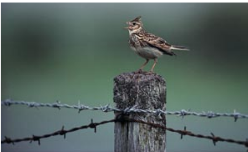
Left: Cereal crops are important for birds such as skylark.