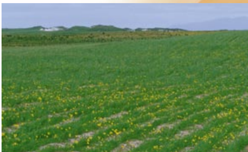
Photos (let to right): Stooking of corn, South Uist; A handful of oats; Charlock growing in cereal crop on machair. Dealbhan (clì gu deas): A cur arbhar ann an adagan, Uibhist a Deas; Làn dom de choirce; Sgeallan a fàs ann an gràn-bhair air machair.

...tha tomhas de dheagh fhearann air a chall gach bliadhna tro leasachadh