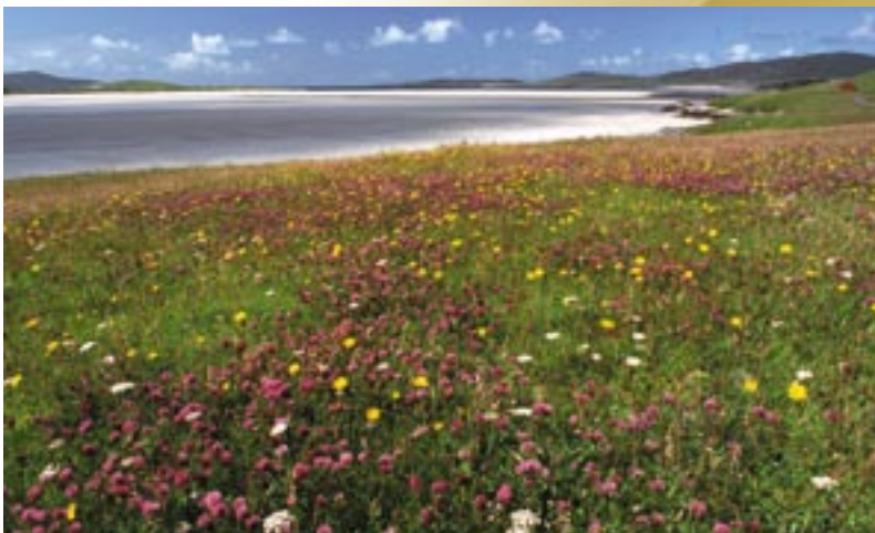
Photos (left to right): Corncrake management indirectly benefits the Great Yellow Bumblebee; Heavy summer grazing can be a threat to the corncrake; Machair at Luskenyire, Harris. Dealbhan (cli gu deas): Tha rianachd an traoin a' toirt buannachd neo-dhìreach don t-seillean mhòir; Faodaidh mòran ionaltradh samhraidh a bhi na chunnart dhan traon; Machair aig Losgaintir, Na Hearadh.

Tha Sgeamaichean maoinichte airson rianachd an traoin a' dèanamh leasachadh neo- dhìreach air an àrainneachd don t-seillean-mòr.