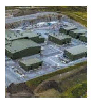
The site is proposed for Arnish

"This demonstrates the value of our consultation with the local community, which is an important part of our project development process. We encourage anyone with an interest in our proposals to come along to our event on November 14th and provide their feedback."