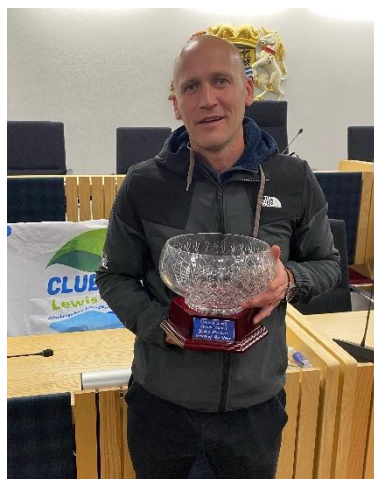
Club of the Year: Point FC U14