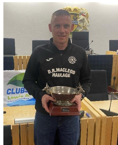
Team of the Year: Stornoway Athletic FC