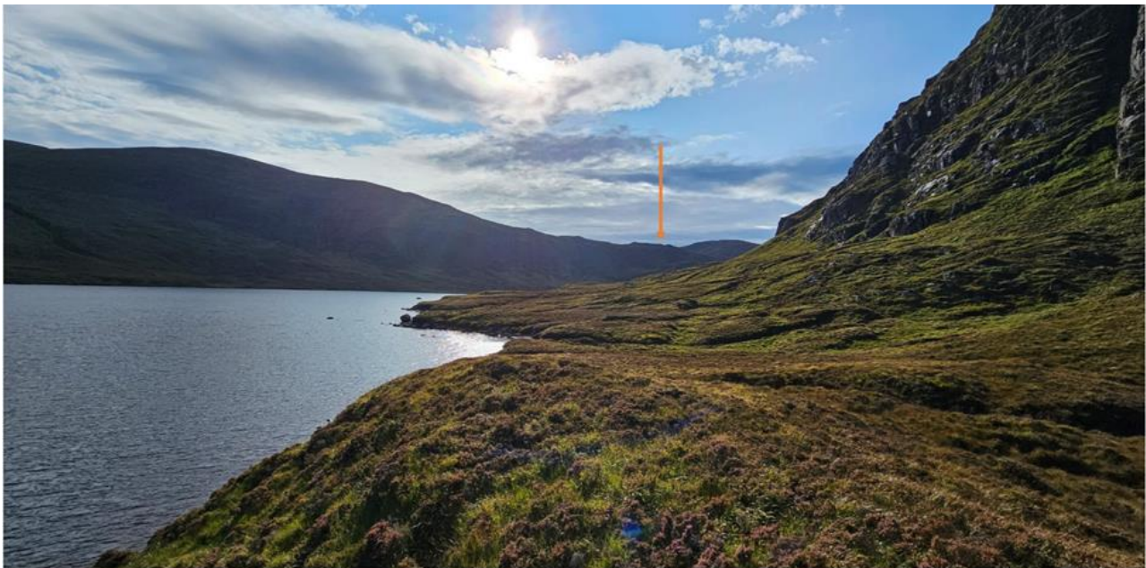
Viewpoint 5. Representative view taken from the shores of Loch Langabhat looking South towards the Site. Elevation 40m AOD, E: 115365, N: 915169