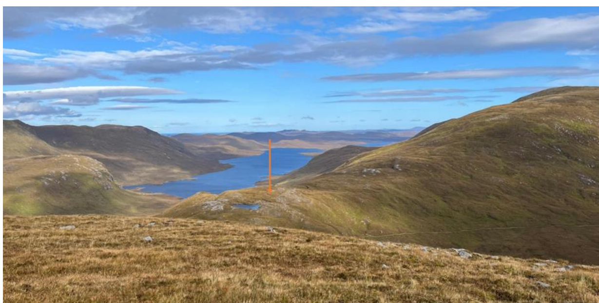
Viewpoint 1. Representative view taken looking North from Mo Bhiogadail, Elevation 376m AOD, E: 115275, N:911222

Viewpoints agreed (black stars shown above) to ensure assessment of the most sensitive viewpoints