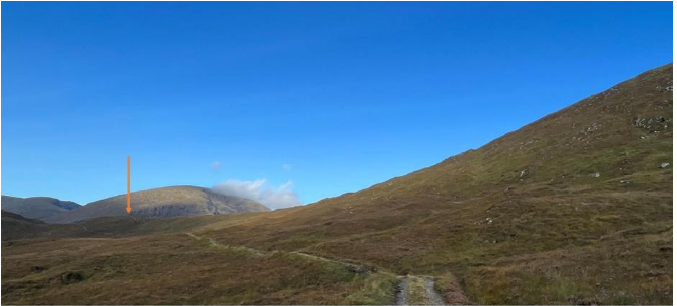
Viewpoint 2. Representative view taken from walking track looking west towards development site. Elevation 110m AOD, E: 115757, N: 911606