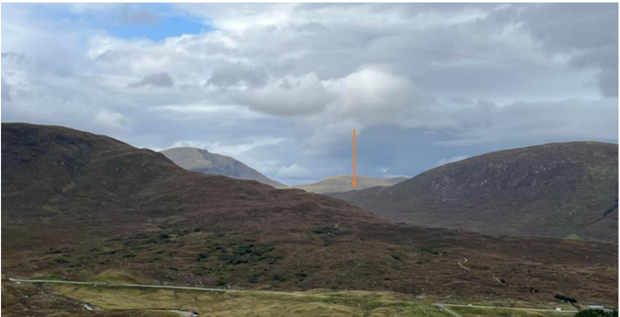
Views from A859 towards the site