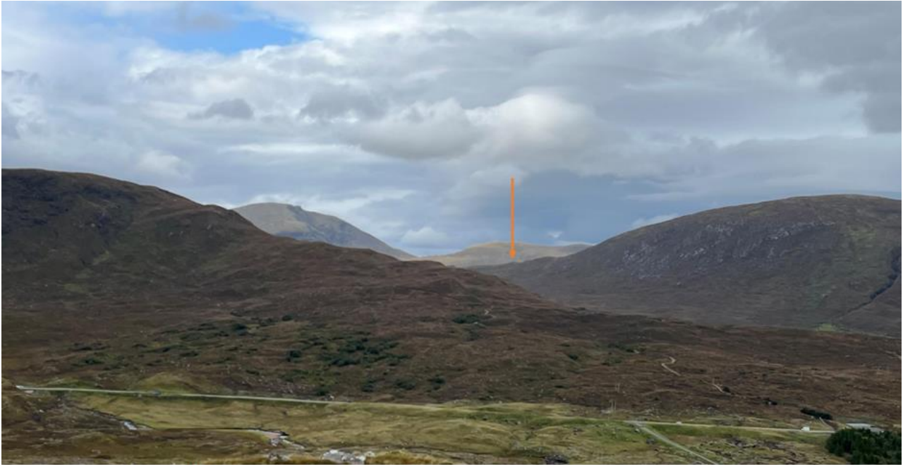
Viewpoint 4. Representative view taken from the A859 adjacent existing telecoms mast looking towards the Site. Elevation 1101m AOD, E: 119335, N: 909726