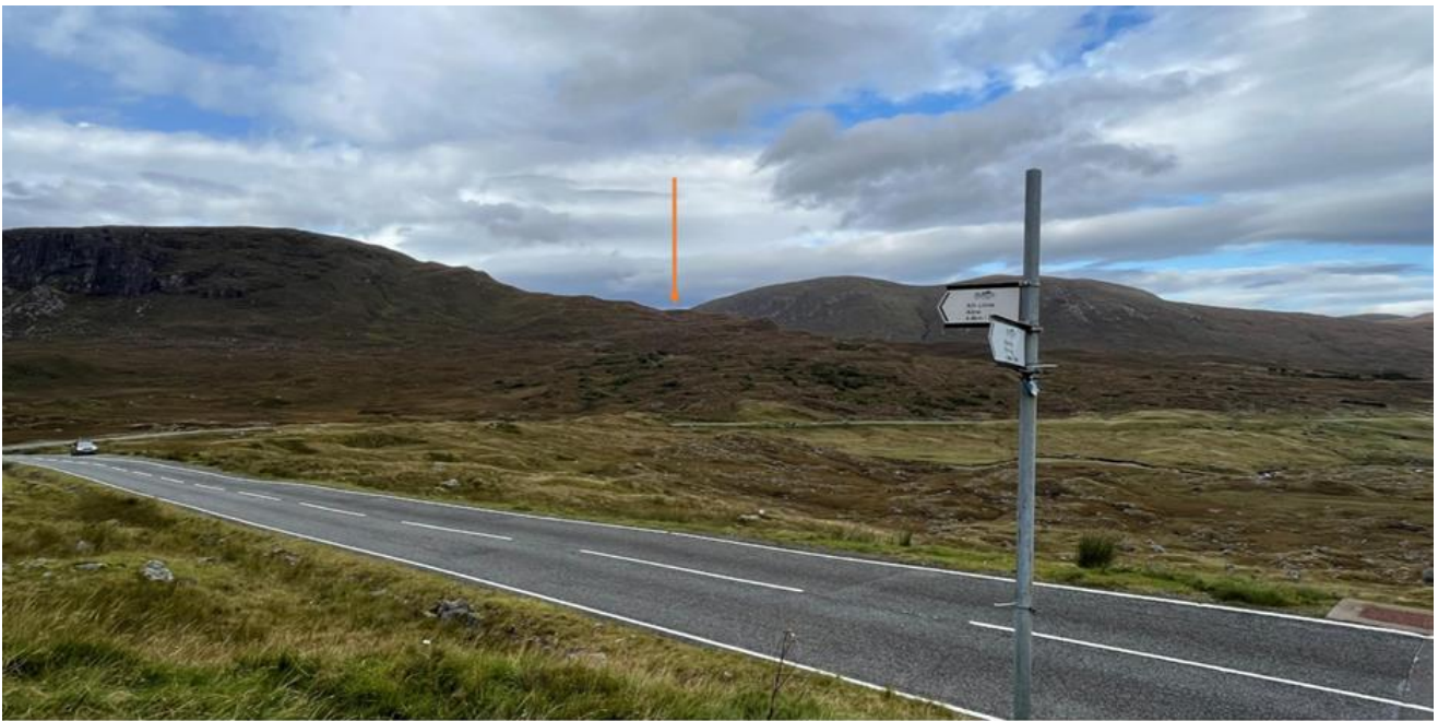
Viewpoint 3. Representative view taken from the Hebridean footpath entrance; old Harris drove road on the A859 looking southwest towards the Site. Elevation 70m AOD, E: 118656, N:909606