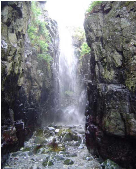
Linginish, Isle of Harris