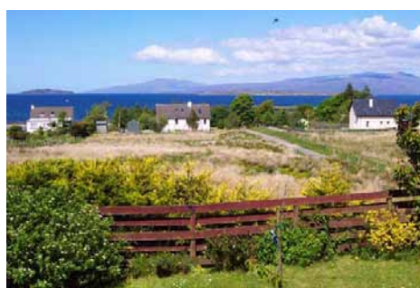
Earsary, Isle of Barra