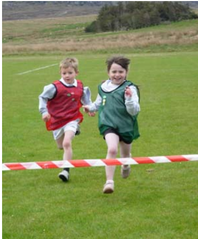
School sports day