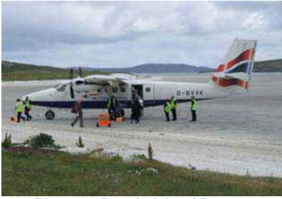
Plane on Beach, Isle of Barra