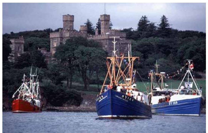
Stornoway, Isle of Lewis