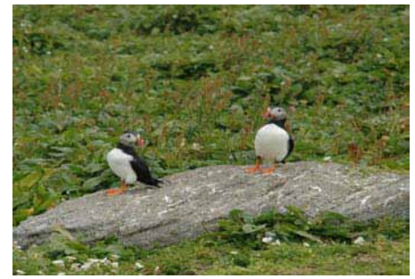
Puffins on Flannan Isles