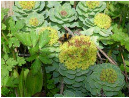
Bumblebee on Roseroot