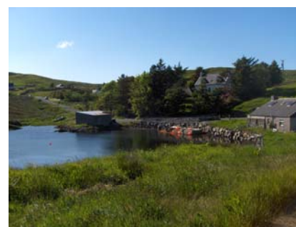
Keose, Isle of Lewis