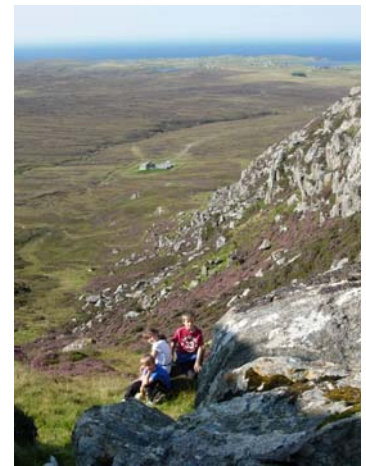
Climbing Beinn Bhragair, Lewis