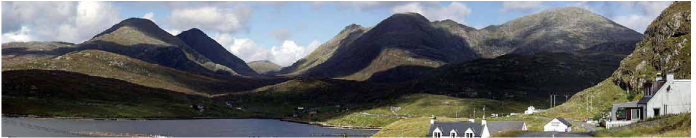
Hills of Harris