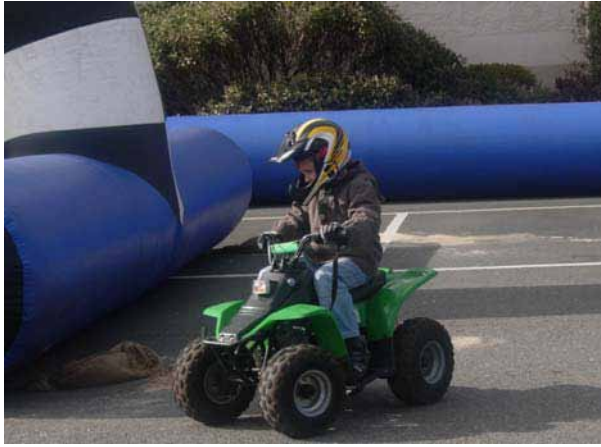
Quad Bike Riding