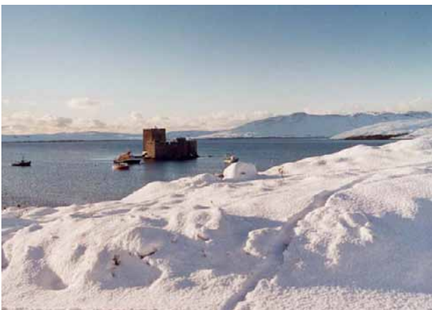
Kisimul Castle, Isle of Barra

Note: Figures may not exactly add to totals due to rounding. *FTE = Full Time Equivalent Jobs Source: Western Isles Regional Accounts 1997 and 2003 www.cne-siar.gov.uk