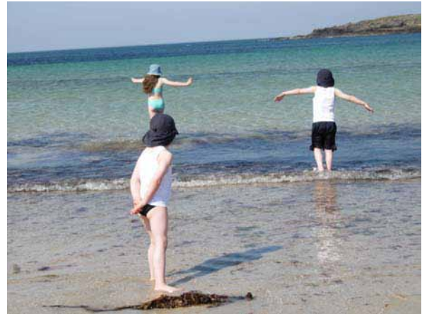
Shawbost, Isle of Lewis