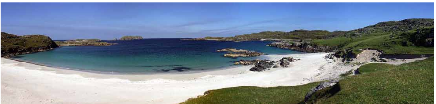
Bosta, Isle of Lewis

Note: these figures are approximate and subject to variation