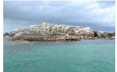
Miavaig, Uig, Isle of Lewis