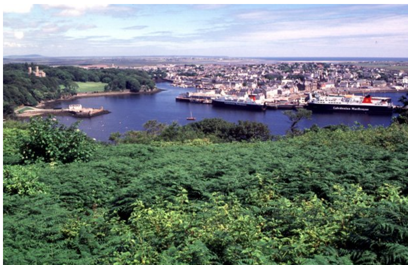
Stornoway, Isle of Lewis

Note: All figures are estimates and should be used with caution