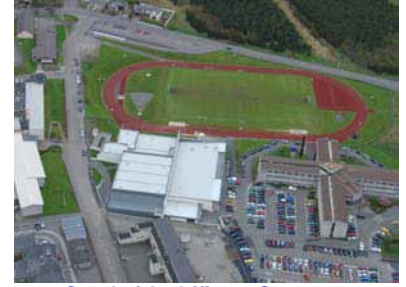
Comhairle Offices, Stornoway