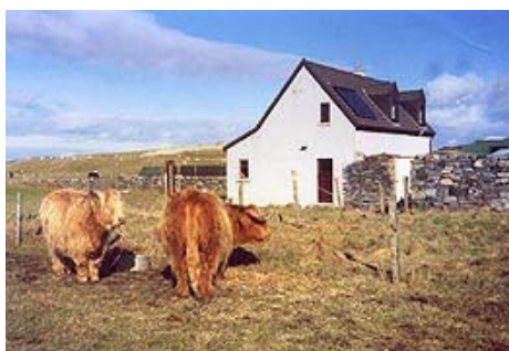
Scaristavore, Isle of Harris

Note: All figures are estimates and should be used with caution