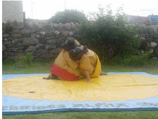
Sumo Wrestling at Fun Day