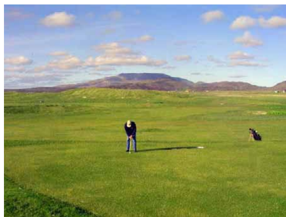
Askernish Golf Course, South Uist