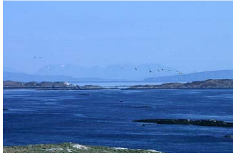
Isle of Killegray