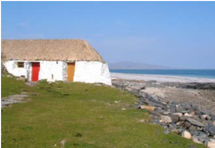
Berneray Youth Hostel